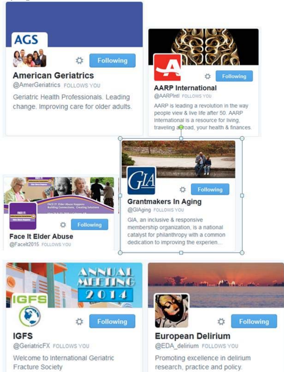
Figure 3 Sampling of ACEP Geriatric Section Twitter Followers November 2014

Over the last year, the Twitter feed from our section ( @GeriatricEDNews ) has grown significantly from 38 followers in October 2013 to 237 followers as of November 10, 2014. Twitter is a social media phenomenon serving as a window to academic medicine and clinical policy development by many individuals, predominantly those of the millennial generation. The @GeriatricEDNews followers include invaluable partners in geriatric care including the American Geriatrics Society, geriatric funding agencies, AARP, the European Delirium Society, the International Federation on Aging, and many others (see Figure 3).